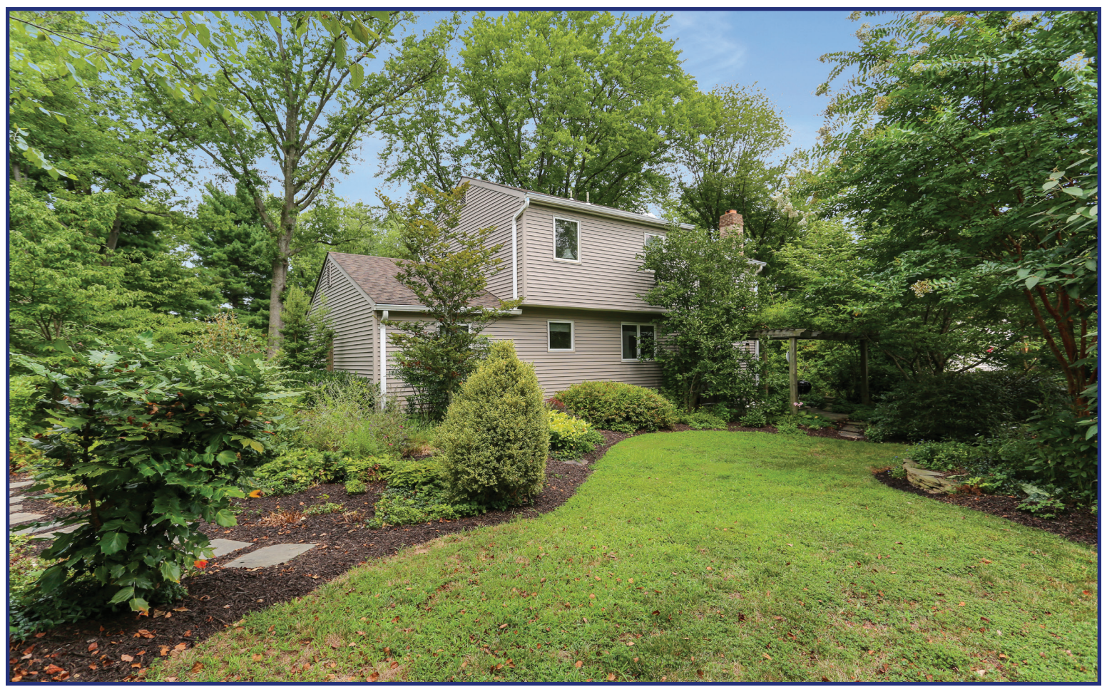
All information deemed reliable but not guaranteed.