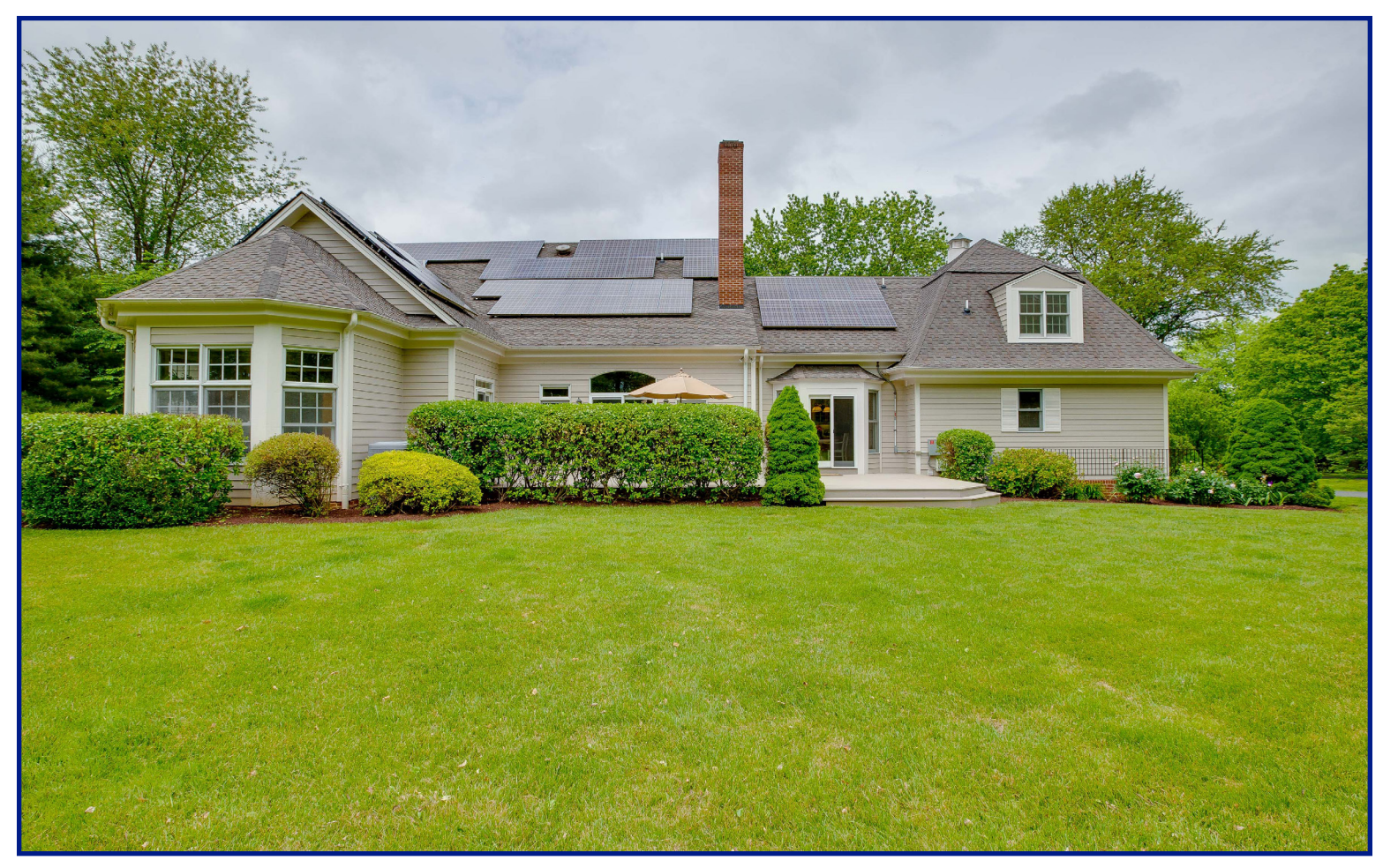
All information deemed reliable but not guaranteed.