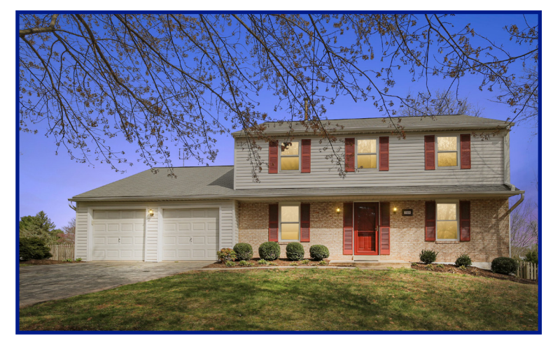
All information deemed reliable but not guaranteed